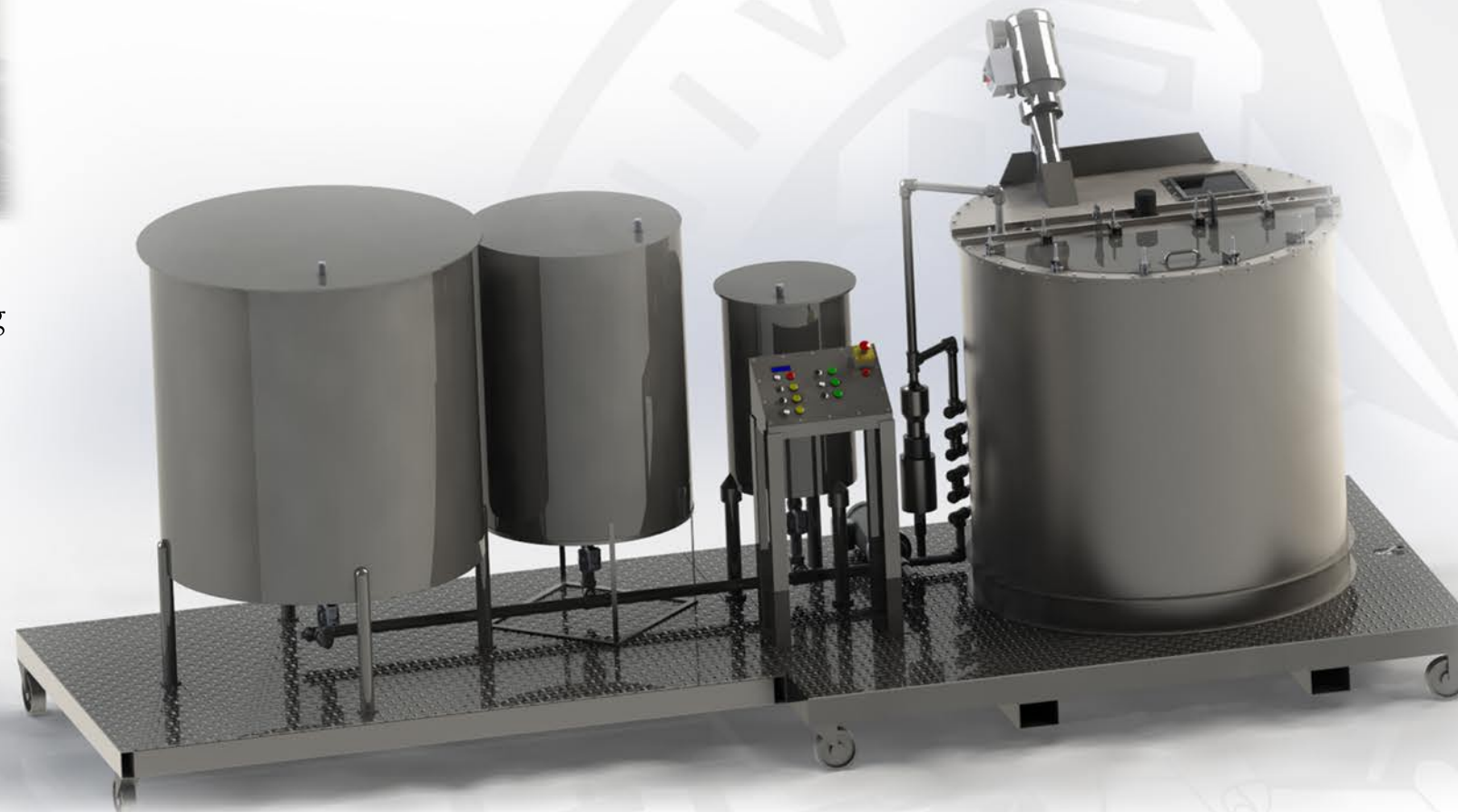
Proposed Future System

Tank Lid: Stainless steel enclosure with dynamic entry port and safety observation window. Includes electric and hydraulic mechanical mixers.